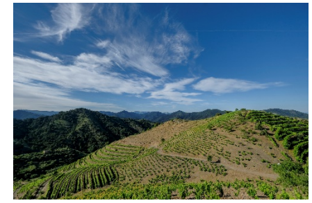
Illustrated left to right: Sassicaia (Tuscany, Italy); Vega Sicilia (Ribera del Duero, Spain); Familia Torres (Catalonia, Spain)