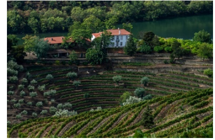
Illustrated left to right: Famille Hugel (Alsace, France); Château Mouton Rothschild (Bordeaux, France); Symington Family Estates (The Douro Valley, Portugal)