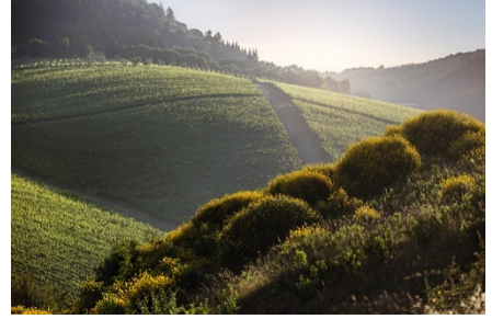
Illustrated, left to right: Pol Roger (Champagne, France); Château de Beaucastel (Rhône Valley, France); Solaia vineyard (Tuscany, Italy)