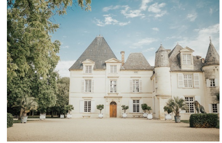
Illustrated left to right: Egon Müller vineyard (Mosel Valley, Germany); Maison Joseph Drouhin (Burgundy, France); Château Haut-Brion (Bordeaux, France)

The PFV places a strong emphasis on upholding the values inherent to these businesses with respect to their support of charity, social responsibility and the environment. Every year, the association awards an Annual Prize of €100,000 to an exemplary family business in any area of activity that best demonstrates family continuity, quality, heritage, values and sustainability. Alongside this, the PFV host a series of gala dinners and benefit auctions around the world in order to raise funds for local charities, present its members' wines and enable consumers to meet the producers face to face. It is at these dinners and auctions that their Limited Edition Collection Cases have always been offered in the past. Sotheby's sale therefore represents the first time that a PFV Collection Case , alongside the even rarer Passport , is offered openly in the global fine wine market.